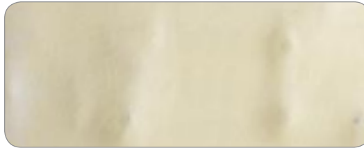
Ballistic Door panel (above) stops the bullets that penetrated the exterior (below).

The next time you find yourself in need of extra protection, show criminals the door. Ford's new Ballistic Door panels offer greater protection when it's needed most. Order your next Police Cars with patent-pending, factory-installed panels.